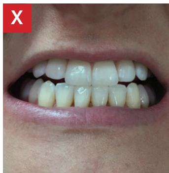
X Do not do this Do not bite down on the front teeth