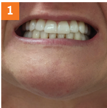
1 Full Front Biting down on back teeth