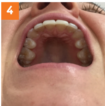
4 Inside Top Jaw Pulling lips away if needed