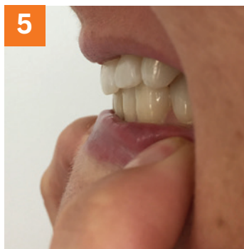
5 Left Side Natural bite pulling lips down