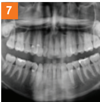
7 OPG Xray Orthopantomogram required for extra work