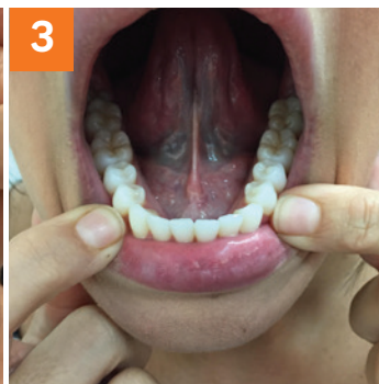
3 Inside Bottom Jaw Pulling lips away