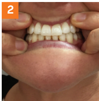
2 Full Front Pulling lips away